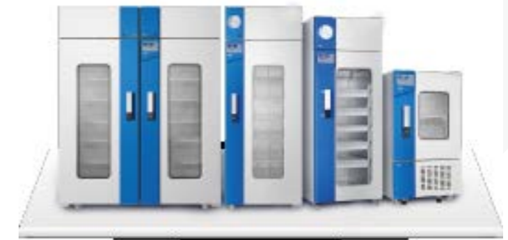
HXC-1369 HXC-629 HXC-429 HXC-149

Refrigeration system is designed with an inverter compressor and dual-speed fans, providing an optimal temperature performance of 4 +/- 1°C inside the cabinet to safeguard stored products.